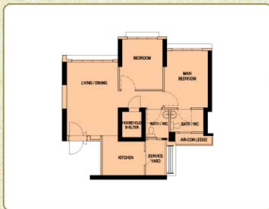
TYPICAL 3-ROOM FLOOR PLAN APPROX. FLOOR AREA 68 sqm (Inclusive of Internal Floor Area 65 sqm and Air-Con Ledge)