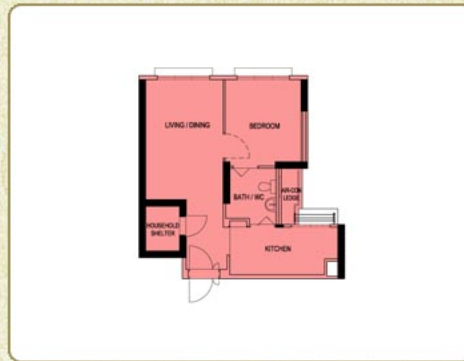
TYPICAL 2-ROOM FLOOR PLAN APPROX. FLOOR AREA 47 sqm (Inclusive of Internal Floor Area 45 sqm and Air-Con Ledge)