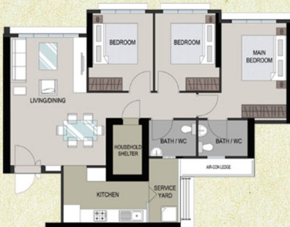
LAYOUT IDEAS FOR 4-ROOM APPROX. FLOOR AREA 93 sqm (Inclusive of Internal Floor Area 90 sqm and Air-Con Ledge)