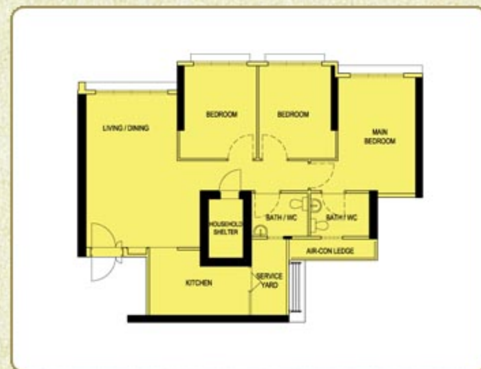
TYPICAL 4-ROOM FLOOR PLAN APPROX. FLOOR AREA 93 sqm (Inclusive of Internal Floor Area 90 sqm and Air-Con Ledge)