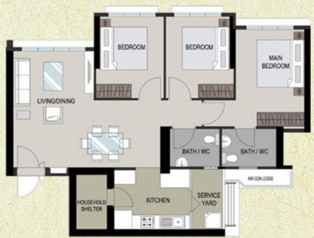
LAYOUT IDEAS FOR 4-ROOM APPROX. FLOOR AREA 93 sqm (Inclusive of Internal Floor Area 90 sqm and Air-Con Ledge)