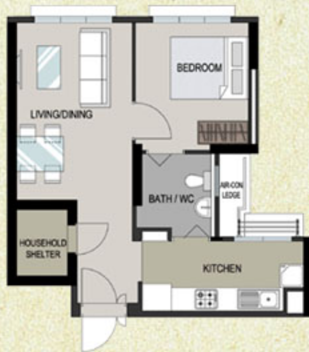
LAYOUT IDEAS FOR 2-ROOM APPROX. FLOOR AREA 47 sqm (Inclusive of Internal Floor Area 45 sqm and Air-Con Ledge)