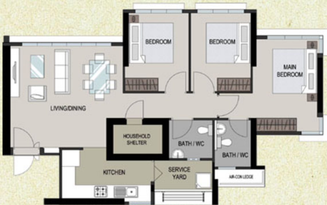
LAYOUT IDEAS FOR 4-ROOM APPROX. FLOOR AREA 92 sqm (Inclusive of Internal Floor Area 90 sqm and Air-Con Ledge)