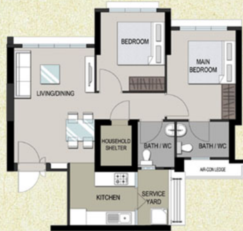
LAYOUT IDEAS FOR 3-ROOM APPROX. FLOOR AREA 68 sqm (Inclusive of Internal Floor Area 65 sqm and Air-Con Ledge)