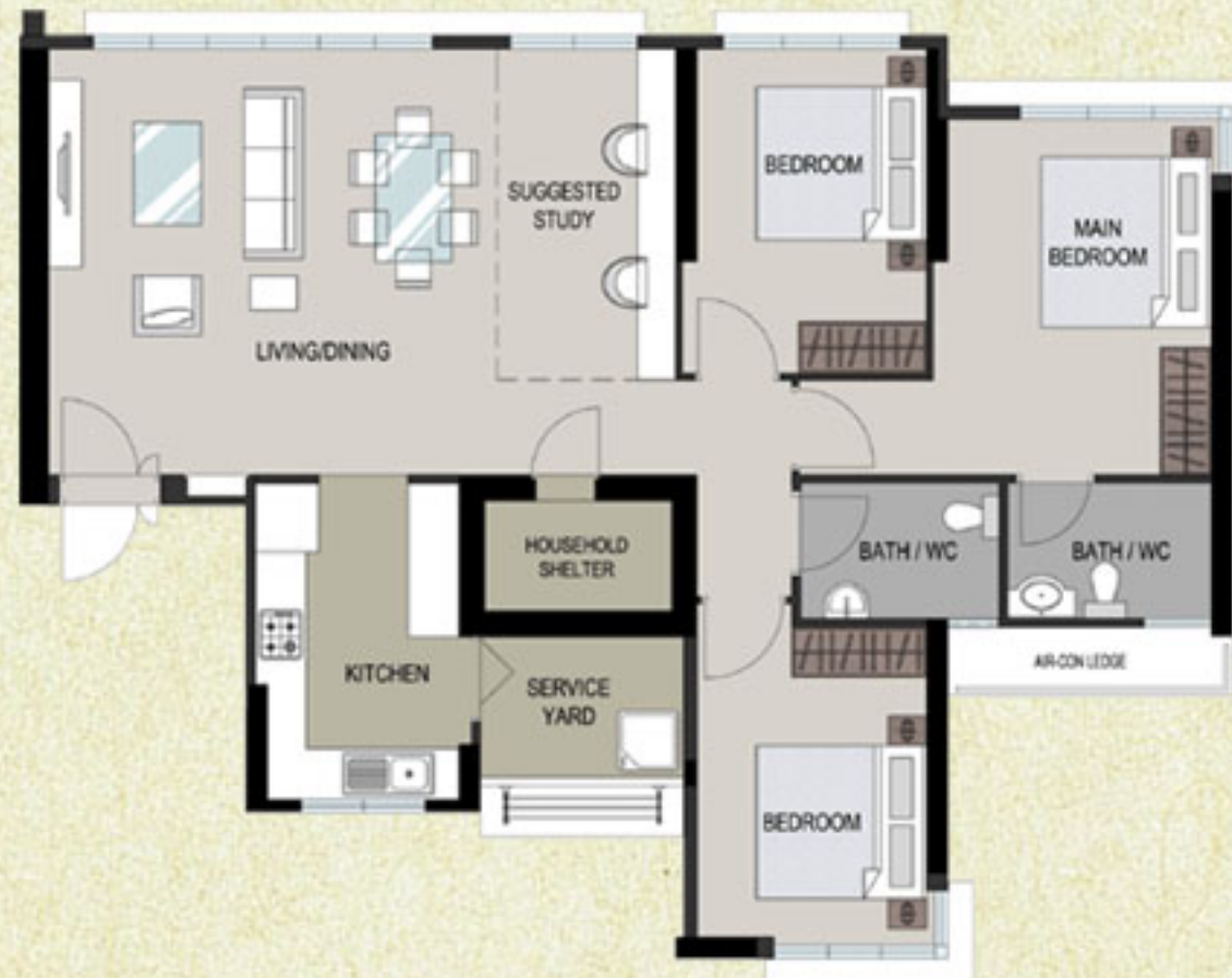
LAYOUT IDEAS FOR 5-ROOM APPROX. FLOOR AREA 113 sqm (Inclusive of Internal Floor Area 110 sqm and Air-Con Ledge)