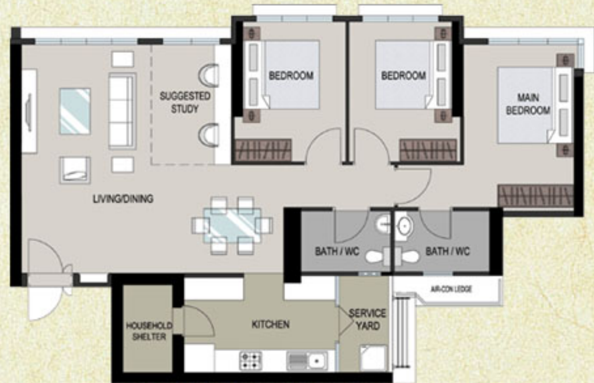
LAYOUT IDEAS FOR 5-ROOM APPROX. FLOOR AREA 113 sqm (Inclusive of Internal Floor Area 110 sqm and Air-Con Ledge)