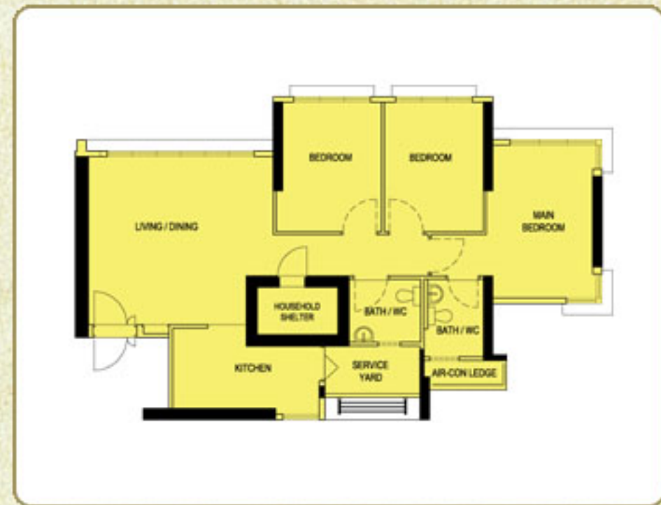
TYPICAL 4-ROOM FLOOR PLAN

(Inclusive of Internal Floor Area 90 sqm and Air-Con Ledge)