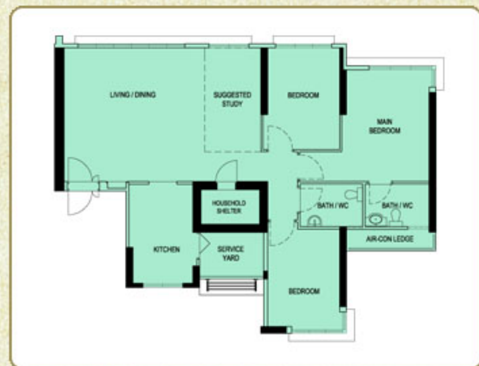
TYPICAL 5-ROOM FLOOR PLAN

(Inclusive of Internal Floor Area 110 sqm and Air-Con Ledge)