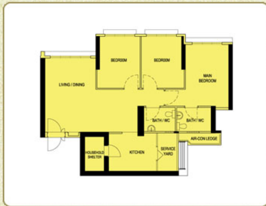
TYPICAL 4-ROOM FLOOR PLAN